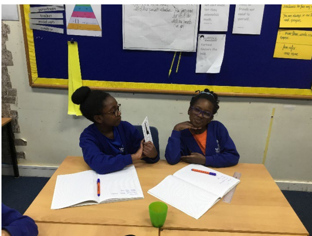
Year 5, telling the time in French