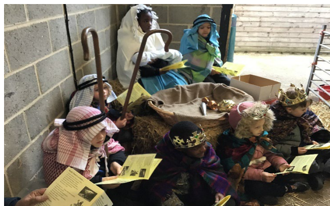
Enacting the Nativity at Deen City Farm