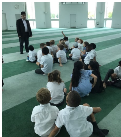
Year 2 visited The Baitul Futuh Mosque