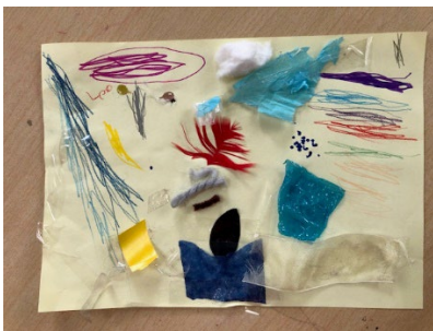
A Nursery child created a collage to represent a family visit to the Temple.